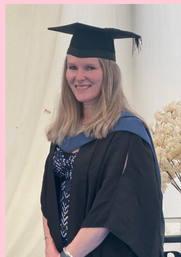
Post graduate Diploma Evidence-based psychological Treatments for the education setting